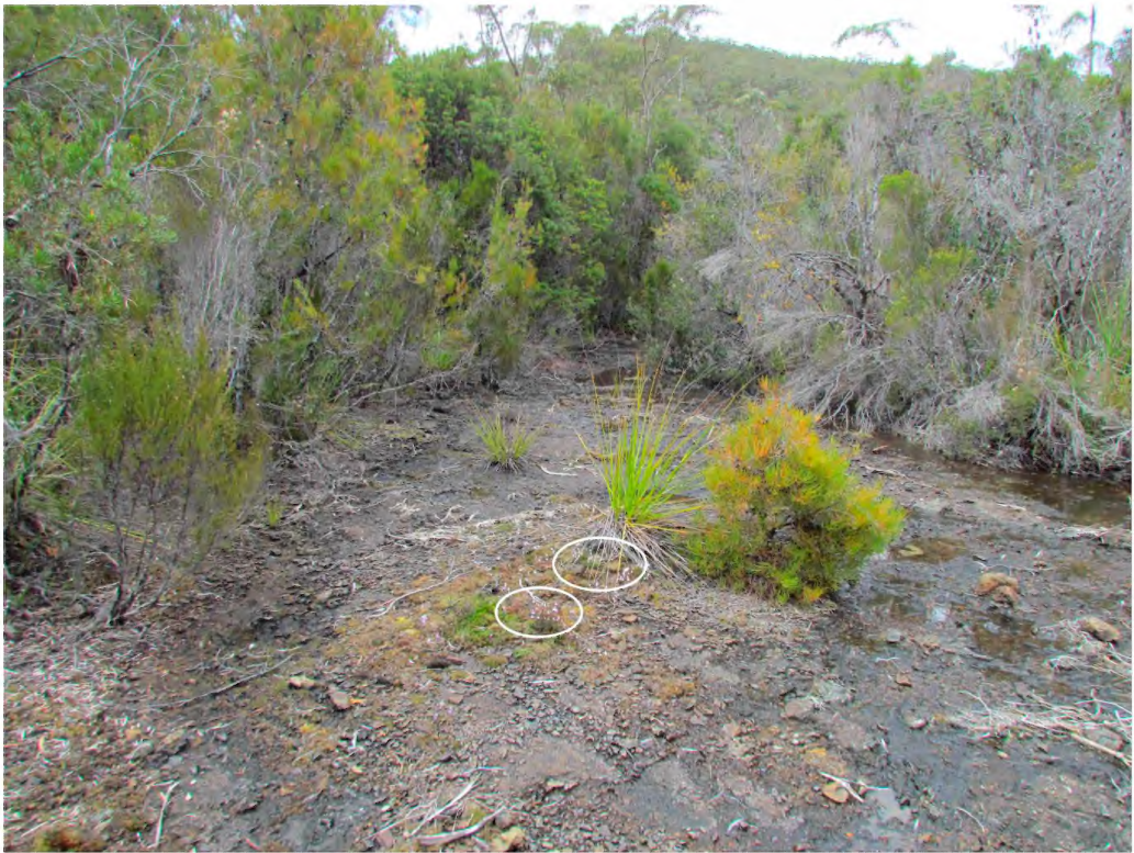
Fig. 5. Euphrasia amplidens grows in and around the “islands” of vegetation and on the fringes of the scrub around the open sediment pans (individuals circled).

flora recovery plan (Threatened Species Section 2011), which includes relevant information on the management of locally restricted taxa.